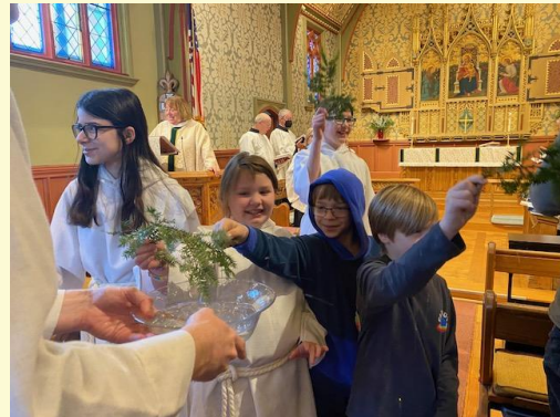
Asperging the congregation with holy water after renewal of our baptismal vows