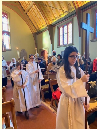
Leading the procession