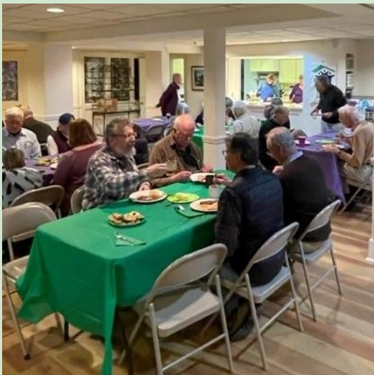
Almost 40 people attended the Shrove Tuesday Pancake Supper on February 21.