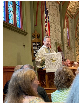
The bishop preached and celebrated at both the 8am and 10am services