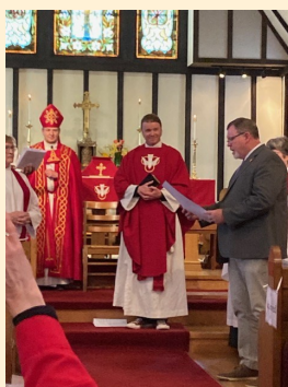
The Chair of the Standing Committee reads the Ordination Certificate.